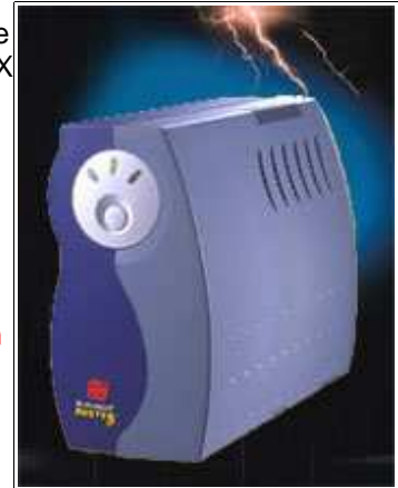
Illustration 1: BlackoutBuster TX

The end result is like this – when there is no power supply, the UPS will run on battery and will shut down the PC in 5 minutes time. Then 4 minutes before shutting down PC, UPS will call CLISMS to send SMS alert to the hand phone number 0163311600 with message “UPS running on battery”.