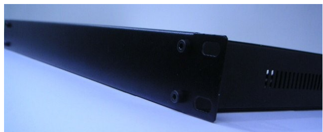
Illustration 2: Side view